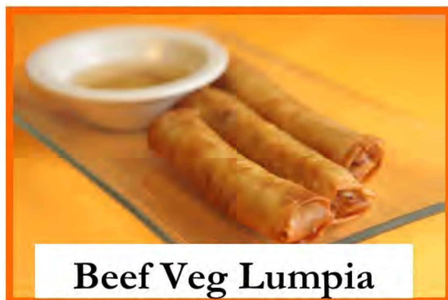
Beef Veg Lumpia